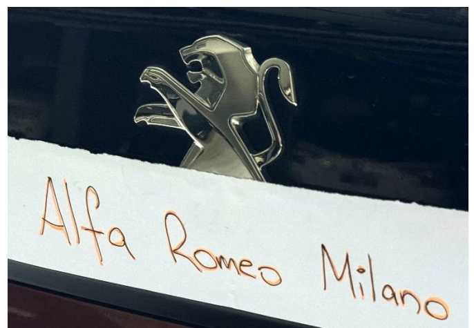
The very suspect 'Pre-release Alfa Romeo Milano/Junior' looking very much like a Peugeot 3008