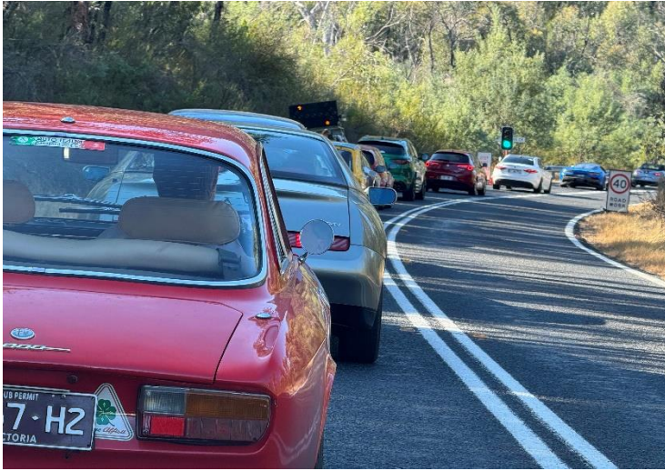
Alfa Convoy slows at yet more roadworks