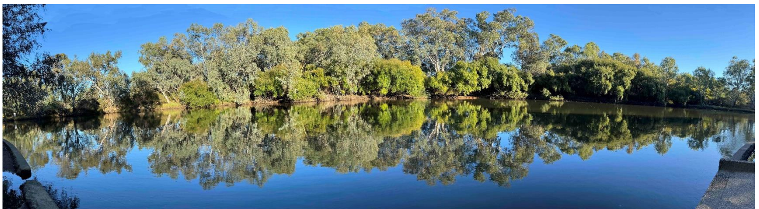
The River Murray near the 'River Deck Café' - Albury

A long day, with an 8-hour drive of 720kms back home. But with Anne Beck keeping me awake and the QV cruising comfortably along the highway, it was thoroughly enjoyable as it literally 'ate up' the distance easily. The fine warm weather certainly helped as well, plus our hearty lunch at the River Deck Café by the River Murray in Albury.