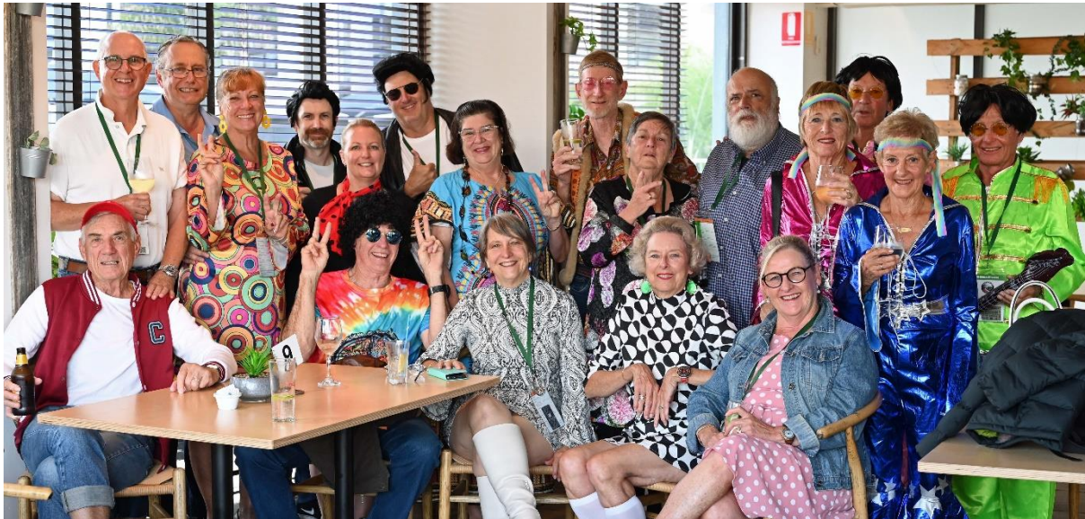
AROCA (Qld) Alfisti 'In the Groove' - Alfesta'24 Gala Dinner