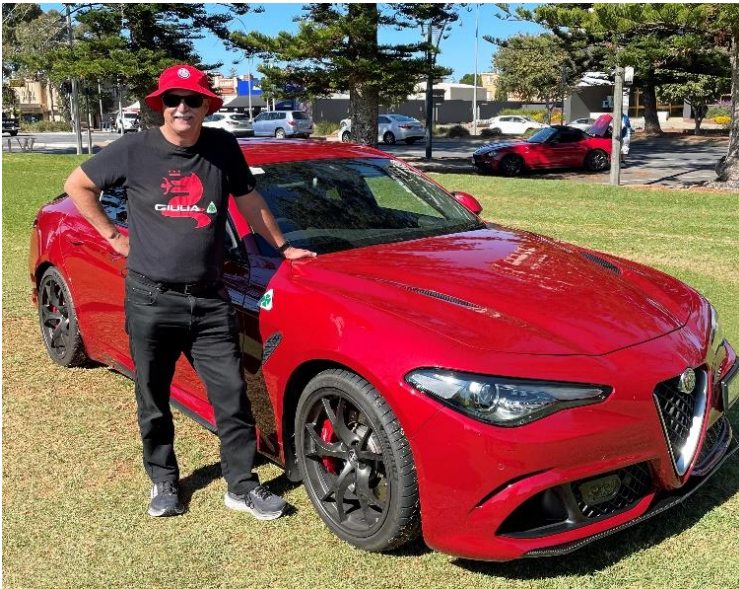
The QV back at Sea Level – Glenelg SA

Fortunately, my SA visit just 'happened by chance' to coincide with AROCA (SA)'s annual 'All Alfa Day' held at the Wigley Reserve in Glenelg. So, this definitely necessitated a slight detour from Pt. Elliot. I've attended this event several times before and it is always a lot of fun catching up with many SA Alfisti who I've got to know over the years. Plus, the opportunity to take yet more photos of more nicely presented Alfas to add to my expanding collection of Alfa images! I also helped the AROCA (SA) club's finances by purchasing a very stylish Alfa 'Bucket Hat' for the day's warm sun plus an all-weather Alfa Jacket ready for Ballarat's impending Winter weather!