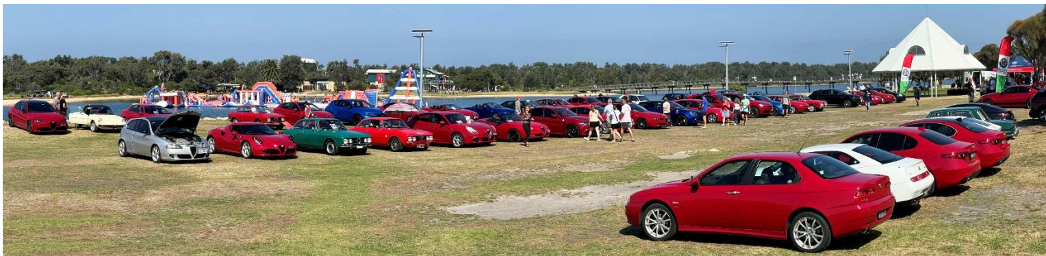
‘Show & Shine’ – Alfesta'24 at Lakes Entrance