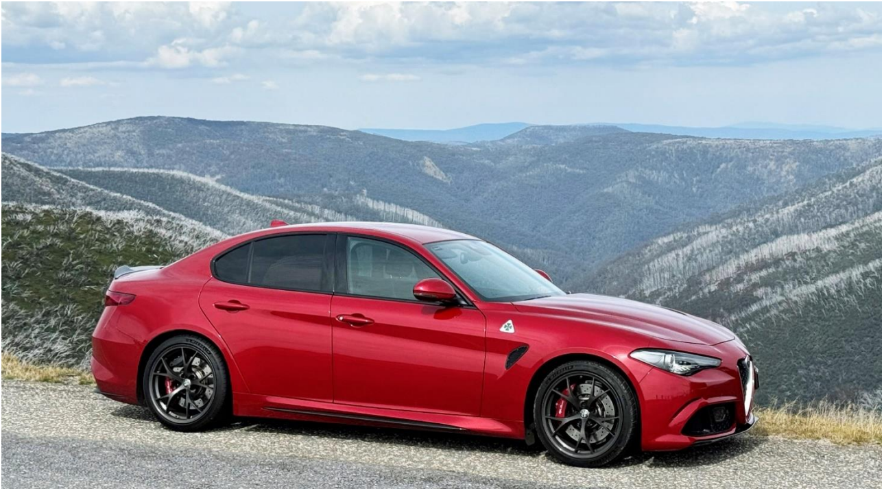
‘On Top of the World’ - the 2021 Alfa Giulia QV near Mt. Hotham (Danny’s lookout)