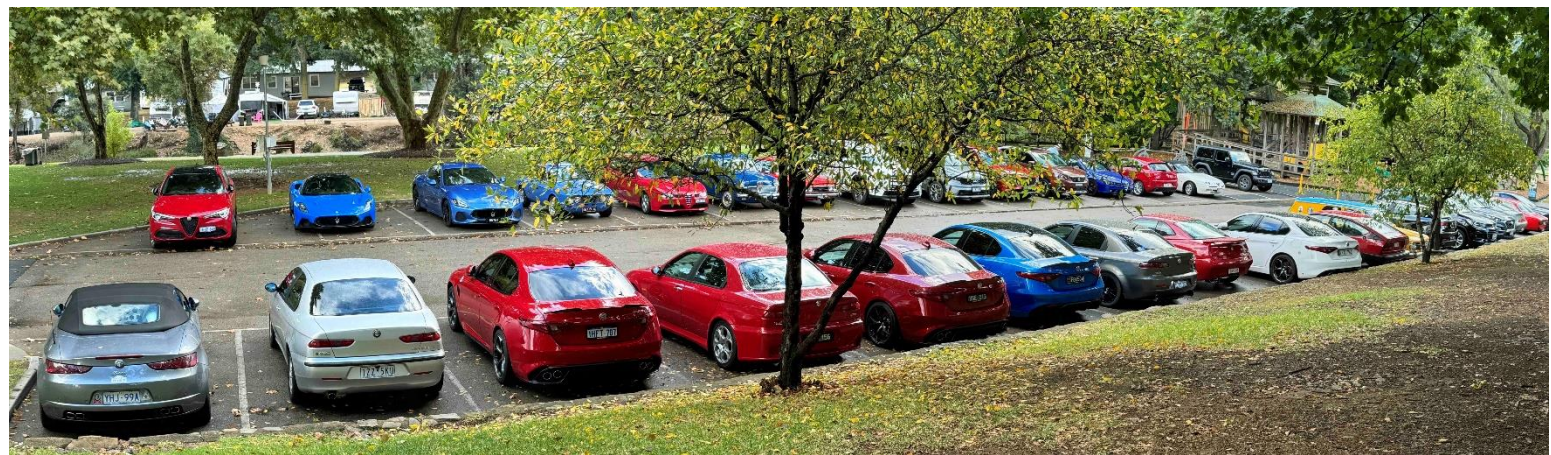
Alfa line-up at the 'Riverdeck Kitchen' Café - Bright