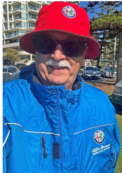
Stylish Fashion Model