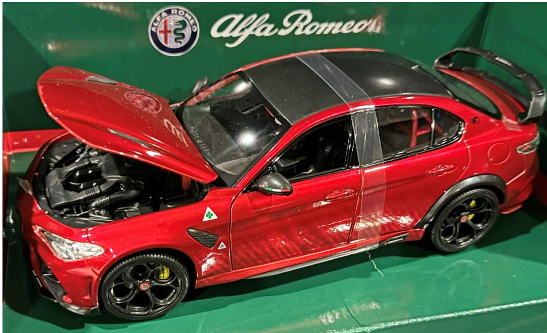
The new purchase – an Alfa Romeo Giulia GTAm

I was thinking that since the QV is now nearly 3-years old and soon out of warranty, perhaps I should trade-it in and upgrade to a Giulia GTAm!! Doubting that this purchase would ever get passed by 'Home Management' OR my financial planner – I decided to 'Just Do It!' without their blessing and buy one! – All be it in 1/18 th scale 😊